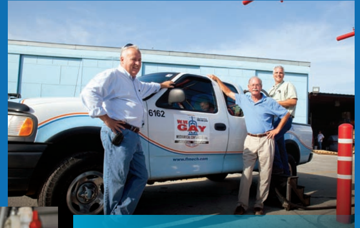
Ferrellgas is helping W.W. Gay convert their fleet to propane and achieve a 25 percent reduction in fuel costs.