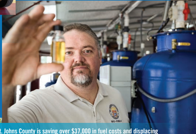
St. Johns County is saving over $37,000 in fuel costs and displacing over 70,000 gallons of petroleum per year by producing their own biodiesel from waste vegetable oil.