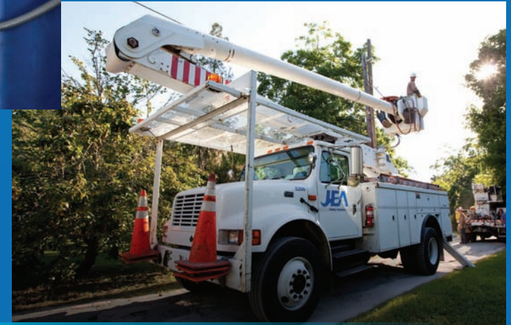
Over half of JEA's fleet can run on alternative fuels, saving thousands of dollars in fuel costs, reducing emissions and displacing thousands of gallons of petroleum.