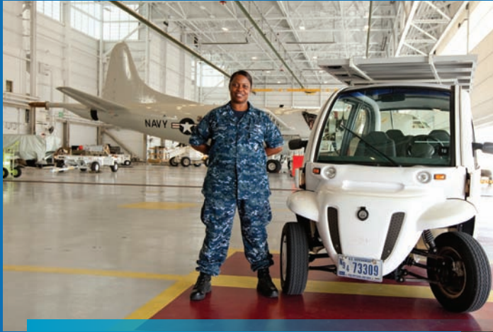
At NAS Jax over half their vehicle fleet uses some type of alternative fuel. They designed a solar-powered car that has been off the grid for nearly two years.