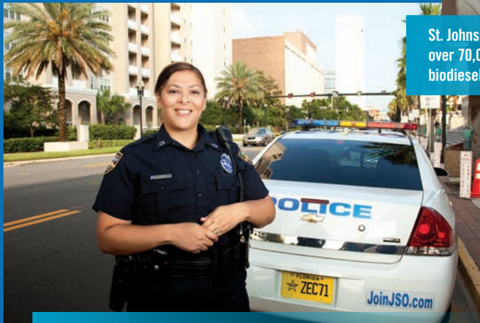
A third of the Jacksonville Sheriff's Office fleet is flex-fueled. Every time officers fill up at the City of Jacksonville E85 pump, it reduces emissions by 25 percent and saves about $5 per tank in fuel costs.